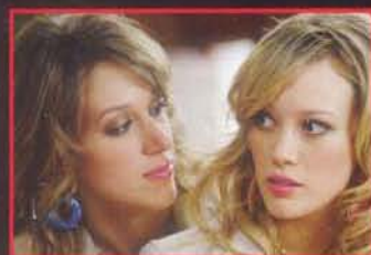
MATERIAL GIRLS: Hilary and Haylie Duff