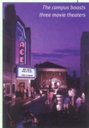
The campus boasts three movie theaters