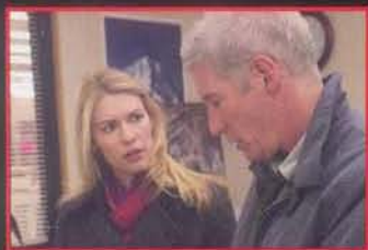
THE FLOCK: Dark Thriller in the Desert Sun