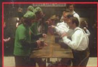
BEERFEST: Bottom's Up for Uncle Sam